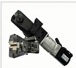
Servo Scissor 伺服剪