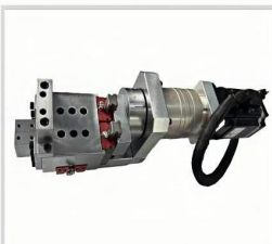
Free Arm 左右摆自由手