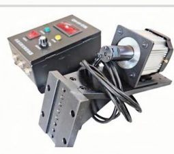
Chamfering Device 倒角机